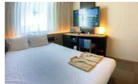
【Standard Double Room】