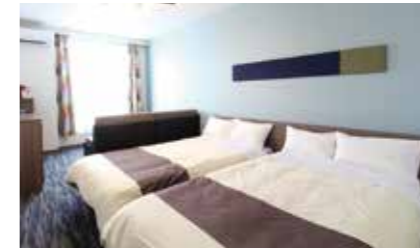
【Standard Twin】(4 guests)