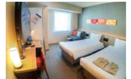
【Deluxe Twin Room】