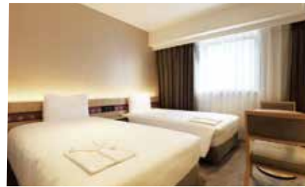
[Superior Twin Room]

Guest Room (Wi-Fi in all guest rooms and all guest rooms are nonsmoking) Total of 104 guest rooms