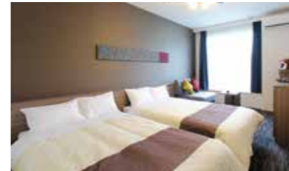
【Standard Twin】(2-3 guests)

Guest Room (Wi-Fi in all guest rooms and all guest rooms are nonsmoking) Total of 100 guest rooms