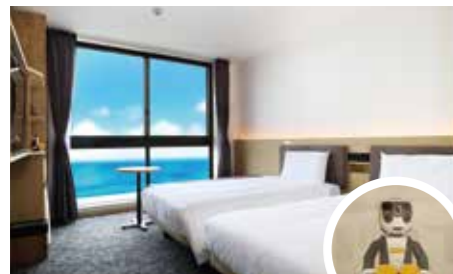
[RoBoHoN Room/ Twin Bayfront]

Guest Room (Wi-Fi in all guest rooms and all guest rooms are nonsmoking) Total of 98 guest rooms